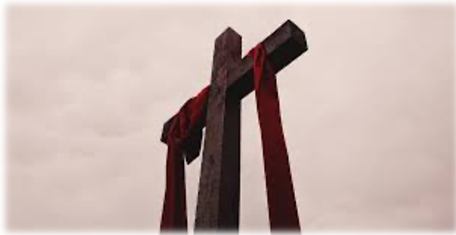
Worship - Tuesday (Offering)