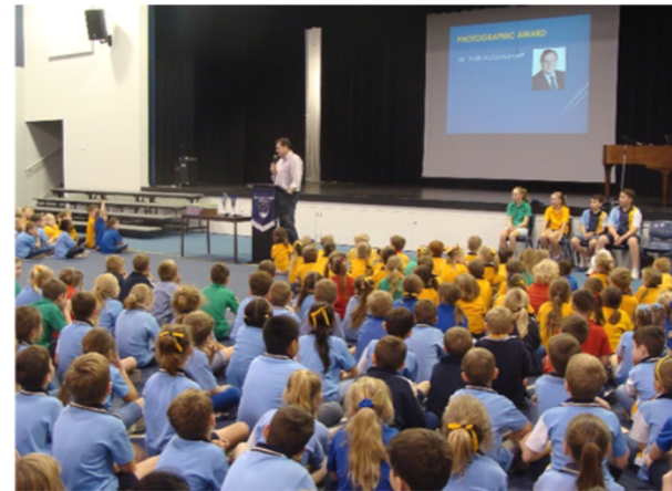
Assembly - Thursday